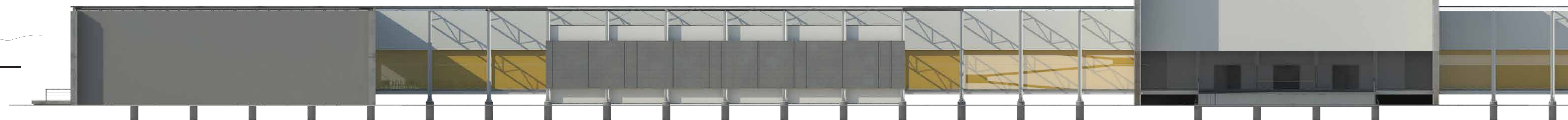
FACHADA NORTE escala 1:100